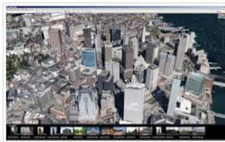
The new tour guide feature in Google Earth 7